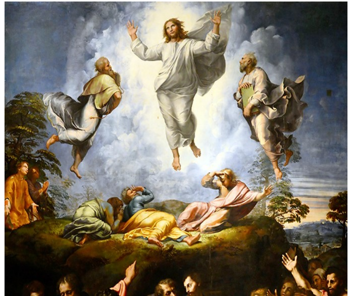
Photo: Raphael, "The Transfiguration", 1516-1520

The radiance of Jesus' glory captures our hearts and calls us to share God's Light and Love with others