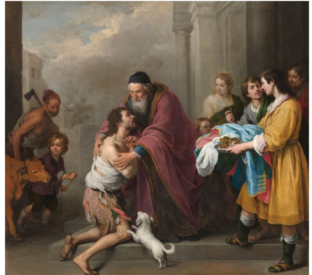
(The Return of the Prodigal Son, 1667/1670, Spain—Bartolomé Esteban Murillo)

On the First and Second Sundays of Lent new holy cards will be distributed to help us pray the Rite of Reconciliation. At the top of the holy card is a picture of the wayward son described in St Luke's Gospel, Chapter 15. It is a beautiful depiction of that moment when the returning son is compassionately embraced by his father.